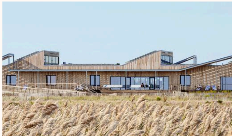
JONES BEACH ENERGY & NATURE CENTER

Over the past 20 years, PureBond® has seen incredible success, being quickly accepted by health-conscious designers and architects . PureBond® has been used in numerous projects requiring FSC® or formaldehyde-free materials, like the Jones Beach Energy & Nature Center in New York, which focuses on the interconnectedness of energy and nature.